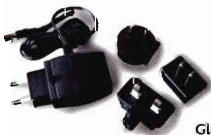
Global AC Adapter Kit