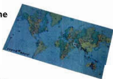
World Time Zone Map